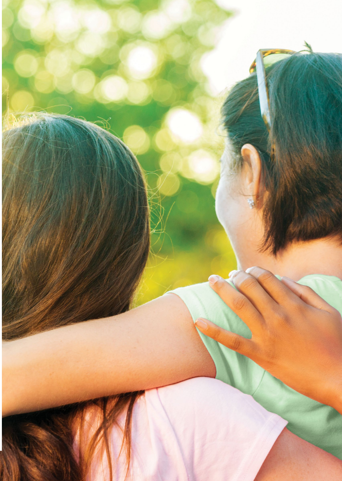
EXHIBIT AND SPONSORSHIP OPPORTUNITIES

September 19 - 21, 2018 | Coralville, IA